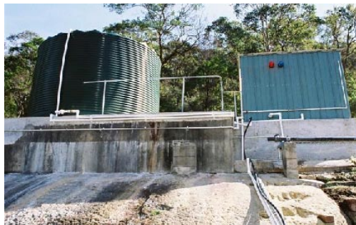
REAR OF PLANT HOUSING SHOWING OPERATION LIGHTS