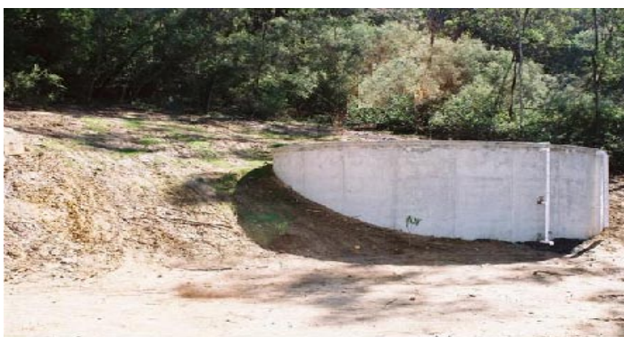
120,000 LTR TANK FOR DOMESTIC WATER SUPPLY