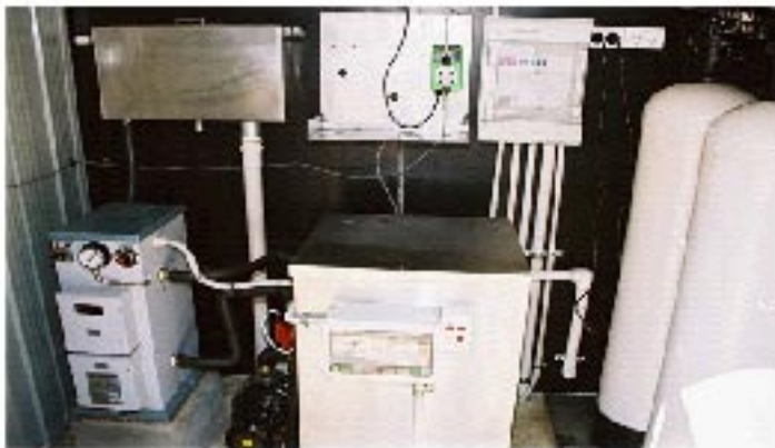
INSIDE THE PLANT ROOM AQUATHERM UNIT AND FILTRATION