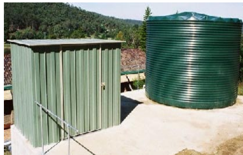
FRONT VIEW OF PLANT SHED AND PRE-TREATMENT TANK